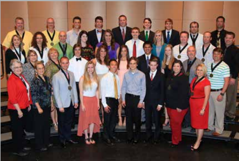
Bentonville High School top academic scholarship recipients and the teacher who made the most significant impact in their education.