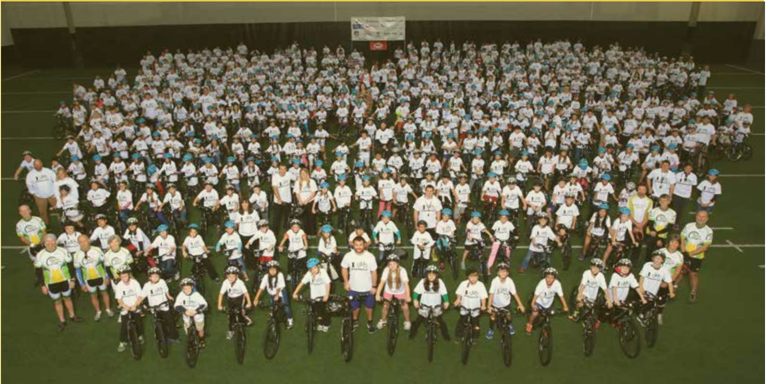
Trail Time Bike Program Kick-off